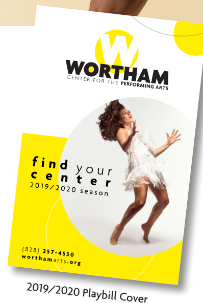
2019/2020 Playbill Cover