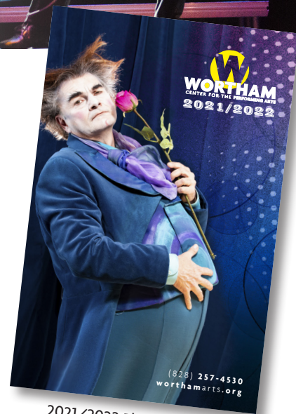
2021/2022 Playbill Cover