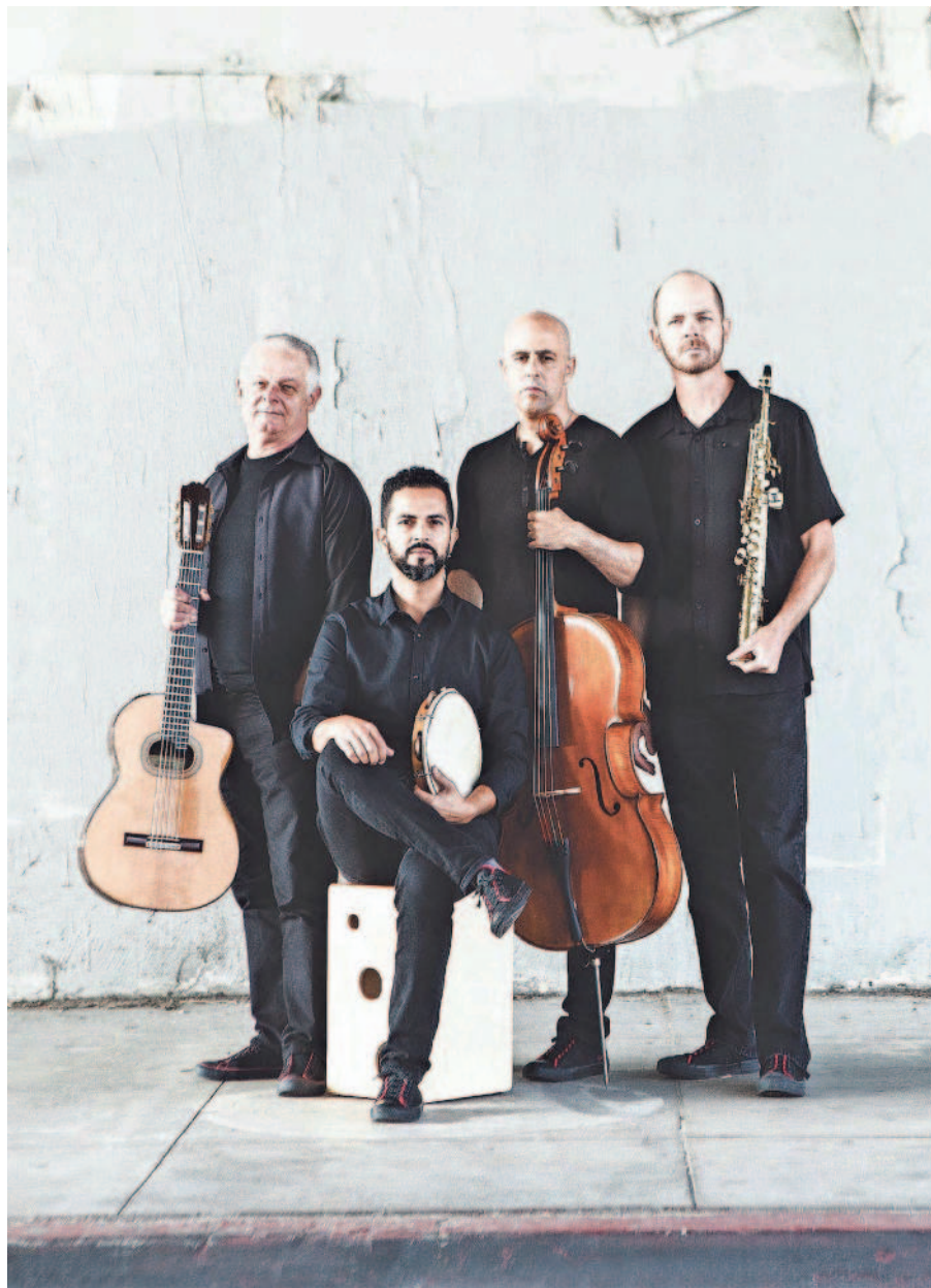
Quarteto Nuevo is scheduled to perform Nov. 12.

Feb. 3: Aquila Theatre presents Jane Austen's "Pride and Prejudice." A local favorite each season, Aquila