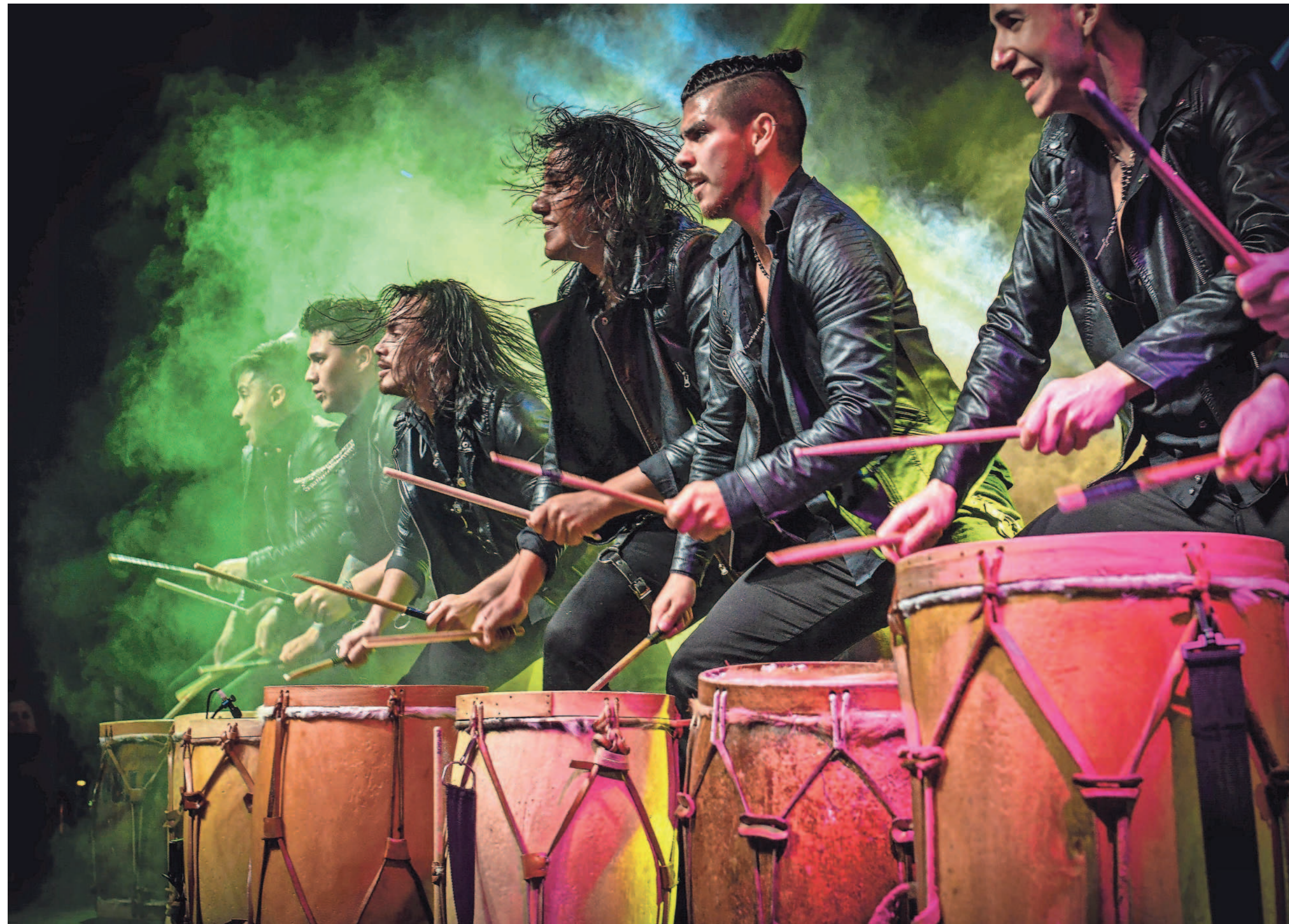
Malevo is scheduled to perform March 3 and 4. FABIAN USET