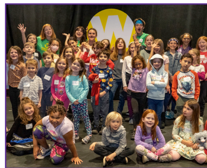
Photo: Wortham Center's Free Play Day, March 2023.

As an Arts for All Kids sponsor, your business increases access for all students by directly supporting the Student Series shows, workshops, and scholarships for underserved students.