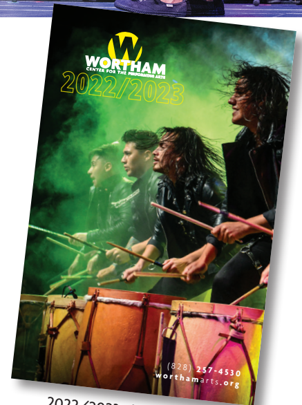
2022/2023 Playbill Cover

Payment, ad contract and ad materials due July 14