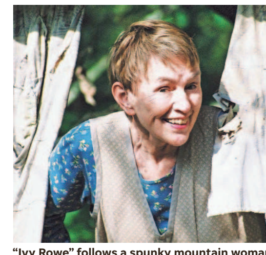
"Ivy Rowe" follows a spunky mountain woman on a journey through life. It is scheduled April 11 and 12 at the Wortham Center.