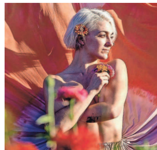
Fan-favorite dance company Pilobolus presents "Re: Creation" on March 22 and 23 at the Wortham Center.