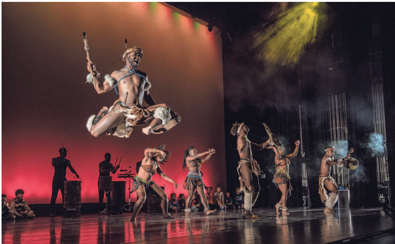
The first professional dance company dedicated to the art of stepping, Step Afrika performs April 19 and 20 at the Wortham Center. SEKOU LUKE

Dance and sway to Lizzy & the Triggersmen (April 13), one of the hottest swing bands to come out of LA. Exuding all the old-school glamor of jazz, swing and blues, this captivatingly modern chart-topping band churns out killer dance songs in a way only a wailing