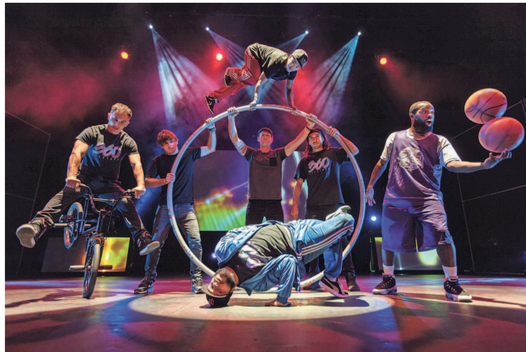
360 Allstars, performing March 27 at the Wortham Center, is a nonstop action-packed urban circus, complete with dancing, beatboxing, acrobatics, BMX biking and more. MATT LONCAR