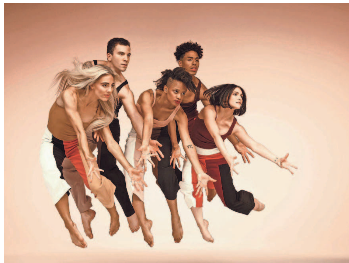
Parsons Dance, appearing Jan. 26 and 27 at the Wortham Center, showcases a dynamic fusion of styles that combines athleticism, grace and unparalleled innovation.