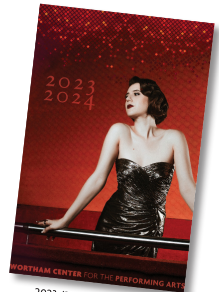
2023/2024 Playbill Cover

Payment, ad contract and ad materials due July 26