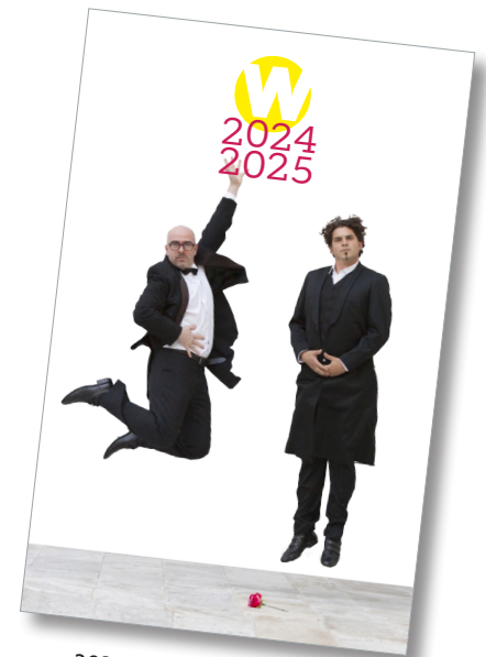
2024/2025 Playbill Cover

Payment, ad contract and ad materials due August 6